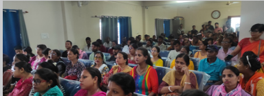
Easter Sunday Outreach