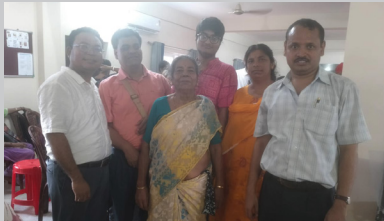
Deaf and Blind Family