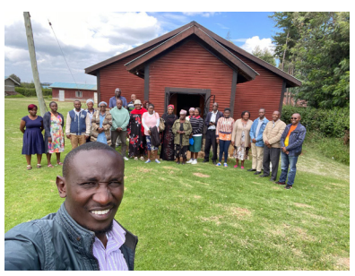
Annual Church Prayer day