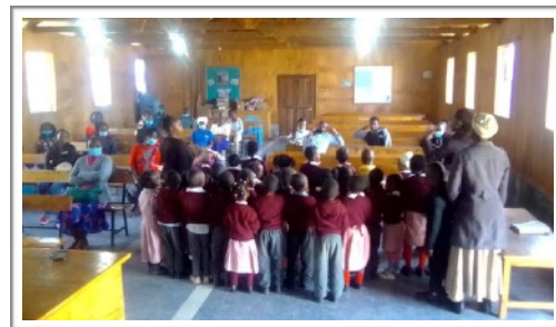
Bible Baptist Academy

Praise the Lord for our church school. By the close of last term, we had 40 kids. This is 15 more than we used to have. Thank you for praying for this to take shape. We are trusting God for a better term starting in mid-May. We hope by the grace of God to increase our capacity by building more classrooms in the future so that the school can begin to fund some church programs. For the first time in the history of the school, we had meetings with the parents; attendance was 100%. I preached to the parents, and the kids blessed the Lord with songs and memory verses in our hearing.