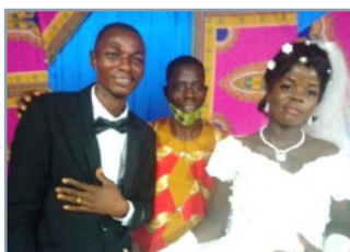
First deaf couple to marry

LIBERIA - Numerous organizations have been partnering with our deaf school to build the first dormitory on a small plot of land. Many exciting things are happening; but, the most important thing is the first wedding celebration between two deaf people who previously had lived together. The church has made great financial sacrifices to demonstrate to unbelieving family members that a wedding is more than just symbolic: like baptism, it is obedience to God's call to be separate and distinct from the world!