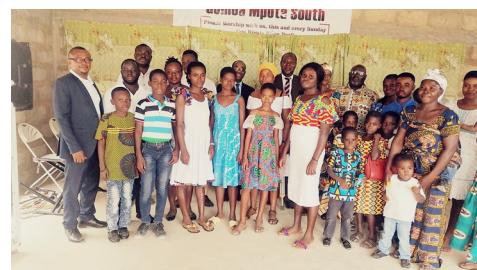
New Church Inauguration